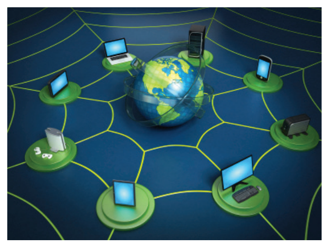
The Benefits of a Managed Services Provider

Freed Up Resources and a Renewed Emphasis on Core Business - Most pricey repairs and recovery costs are the result of a lack of consistent monitoring and maintenance. While these activities are absolutely critical to day-to-day business operations, they are also repetitive, monotonous and "a time kill" for any IT support on payroll. Both business owners and internal IT staff would much rather focus on revenue enhancing tasks like product development or the creation of cutting-edge applications/services. This is one reason routine monitoring and maintenance tasks are often neglected by an internal IT person or team, which always proves to be detrimental much later.